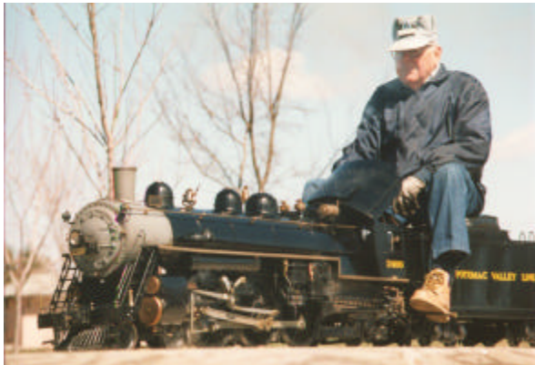
4-6-2 Pacific (1-1/2"-scale)

Monthly meetings are held at the park on the 2nd SUNDAY of each month and our news bulletin, THE STEAM WHISTLE , keeps everyone informed of our activities. We hope you will be tempted to join us in helping others become aware of the past and present technology of steam power.