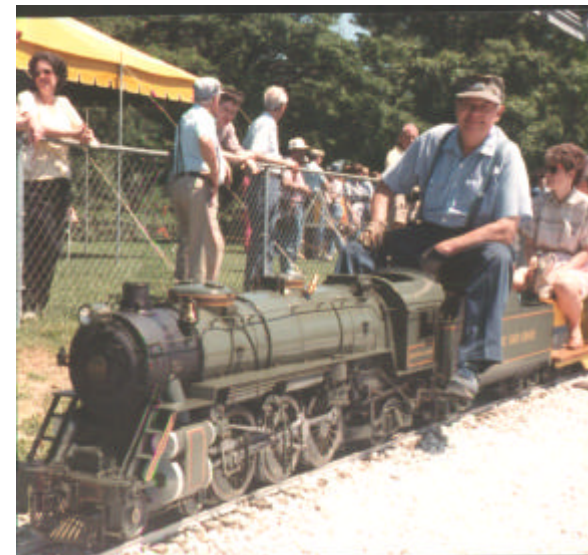
4-6-2 Pacific (1.6" scale) On the tracks of the

On the 2nd Sunday of each month April thru November