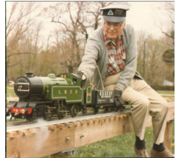
A 3/4"-scale British Locomotive