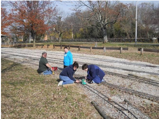
(I) Removing 1" Track Joiners