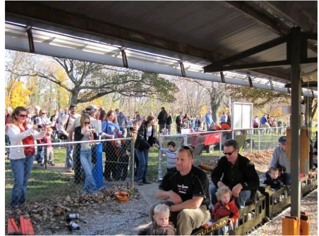
(B) And Then at 1:45 It Is Still As Large! With 12 Carloads on the Rails!