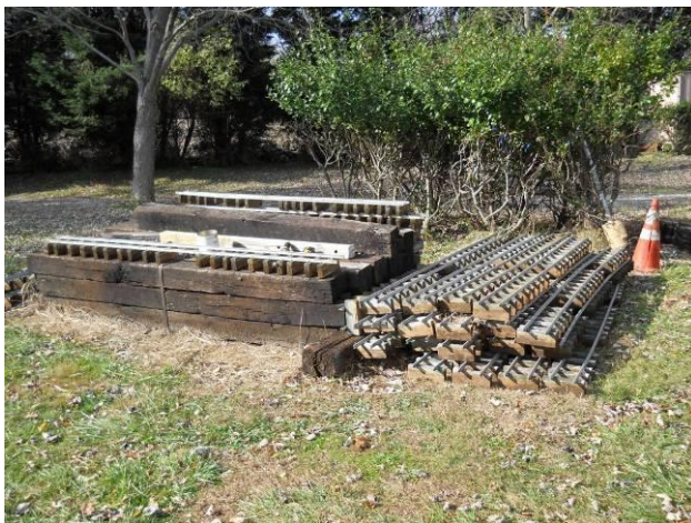
(K) And Stacked and Being Disassembled