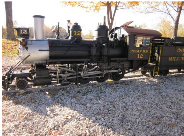
(H) The Patapsco & Mill Valley Consol Up Close