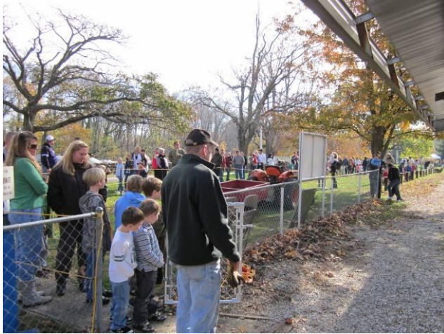
(A) The Crowd for the First Run of the Day