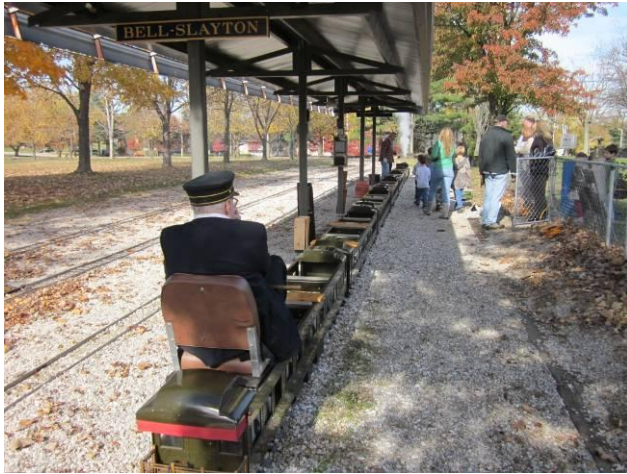
(C) The Adams Is Ready for Loading