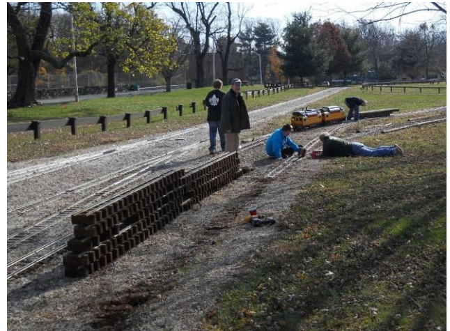
(J) Lots of 1" Track Now Out of Ground