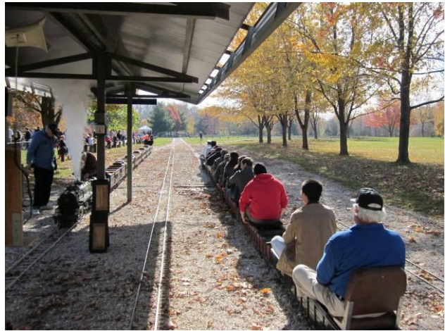
(D) Here's Chessie Departing Full